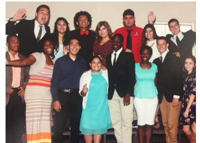
Senior Group Photo Wednesday, Nov. 6 9:15 AM