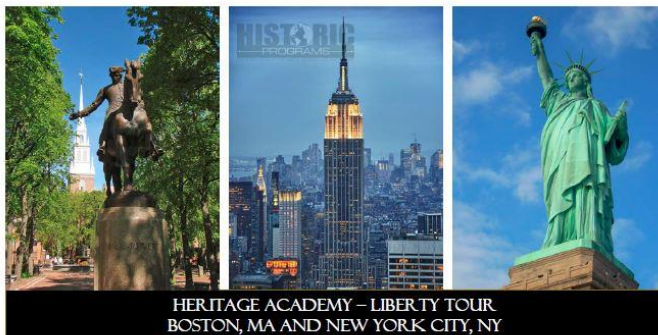
HERITAGE ACADEMY – LIBERTY TOUR BOSTON, MA AND NEW YORK CITY, NY